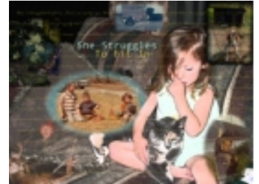
She Struggles to Fit In