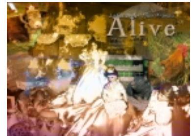
Ladies Prefer Their Animals Alive

Discounts of $25 Each when ordering two or more Large, Signed Prints!