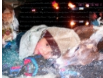
That's Just the Way It Is?