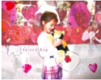
Open Your Heart