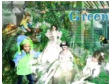
Ladies Prefer Their Environment Green