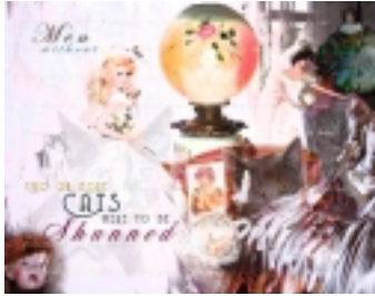
Men Without Cats