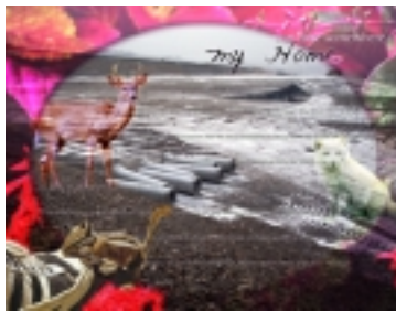
My Home Was Here Somewhere

Discounts of $25 Each when ordering two or more Large, Signed Prints!