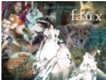
Ladies Prefer Their Fur Faux