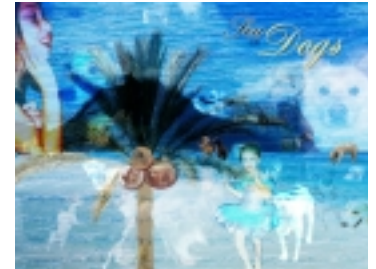
Sea of Dogs