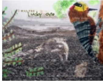
I Was the Lucky One