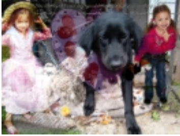
She Doesn't Even See It