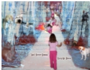
Ain't Never Gonna' Keep Me Down