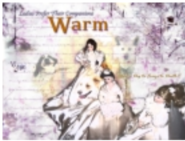
Ladies Prefer Their Companions Warm