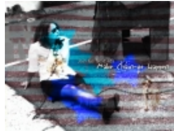
Join Me Next 4th