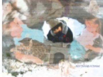
As If Through A Tunnel