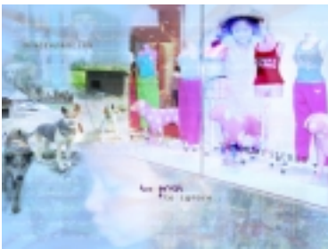
Discrepancies Too Great to Ignore